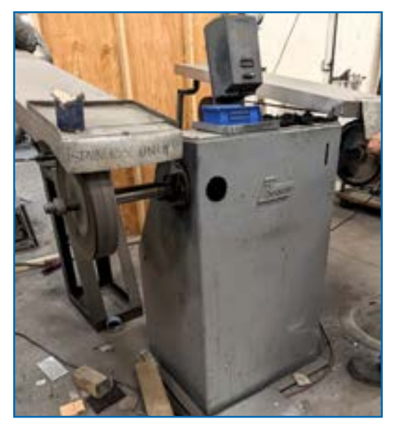
PROGRESS HEAVY DUTY DUAL SANDER/BUFFER