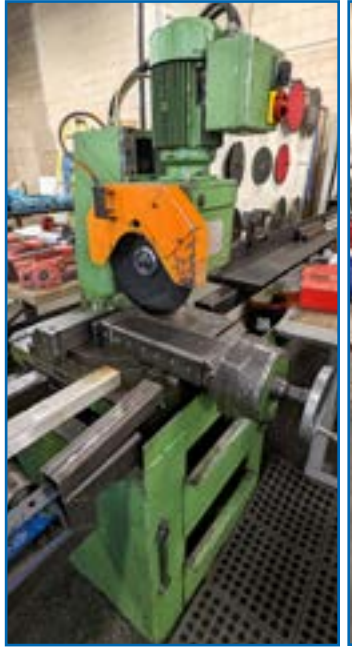
WALTER CS300 COLD SAW