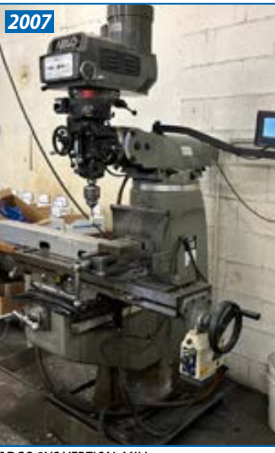
ARGO 2VS VERTICAL MILL