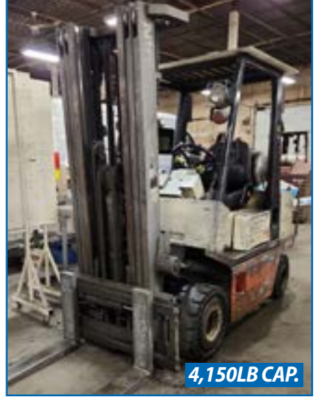
NISSAN PROPANE FORKLIFT