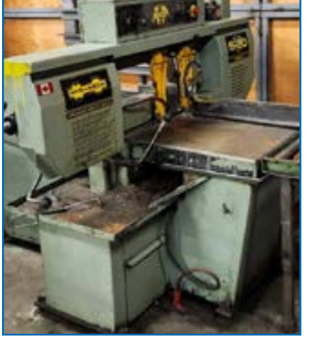
HYD-MECH S-20 SERIES II HORIZONTAL BANDSAW REMI-EISELE VMS350 COLD SAW