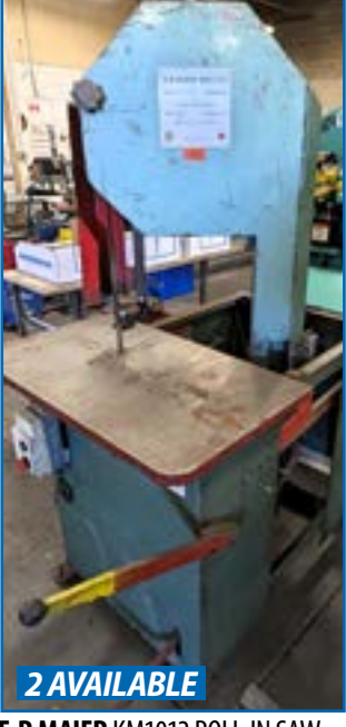
E-R MAIER KM1012 ROLL-IN SAW